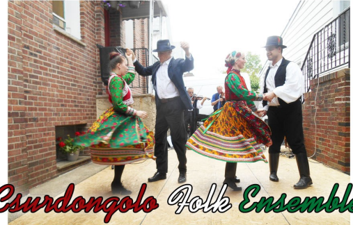
Csurdongolo Folk Ensemble