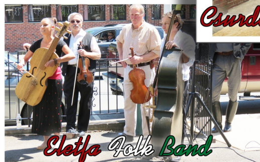
Eletja Folk Band