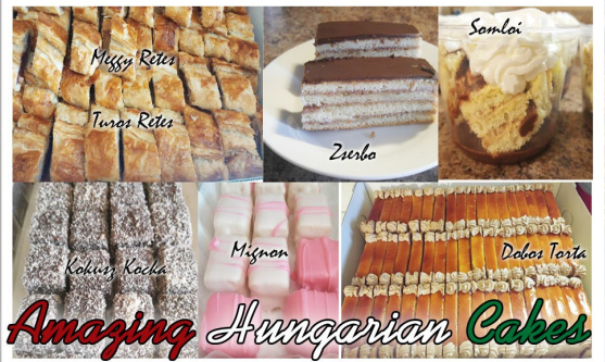
Amazing Hungarian Cakes