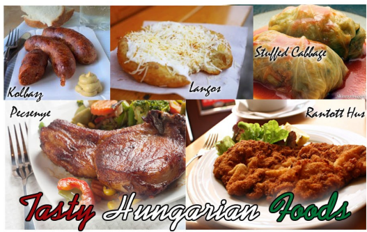
Tasty Hungarian Foods